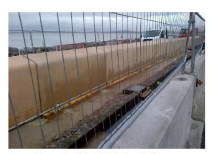
Morecambe Wave Reflection Wall

DEFRA Grant-In-Aid spend of at least £228m on NW coastal projects (2010-2016)