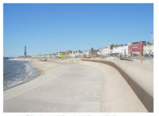
Blackpool Central Area Scheme

Reporting financial spend on projects to National / DEFRA